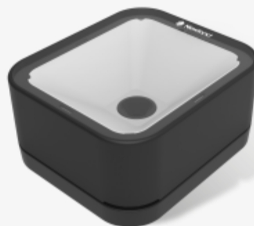
FR27 Urchin stationary scanners