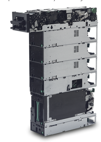
■ Cash recycling 3 recycling modules, 1 loading cassette, 1 cash box & 1 exception box

Flexible configuration can be achievable, according to customer's needs. (Max. 772mm height)