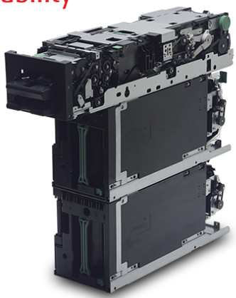
Cash acceptor 2 cash boxes