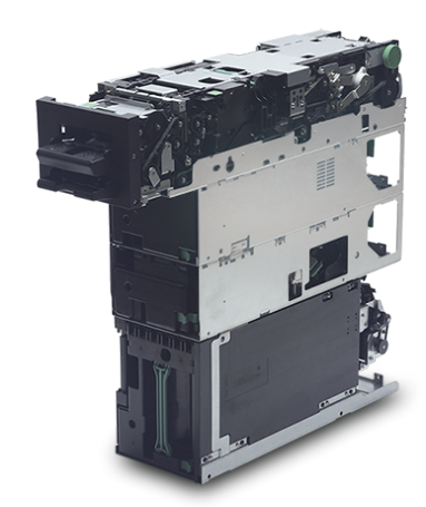
Cash recycling 1 recycling module, 1 loading cassette & 1 cash box