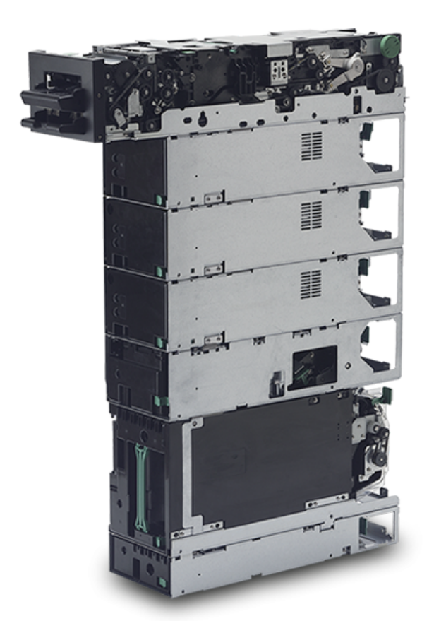
Recycling configuration of GSR50